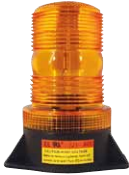
Part No. 6220A-2