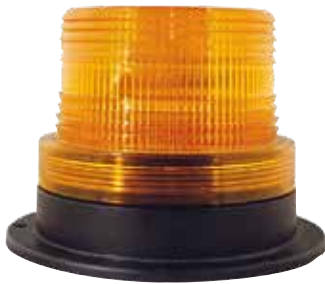
Part No. 6400A-1

Vision Alert offers a budget range of strobe safety beacons designed for the fork lift industry.